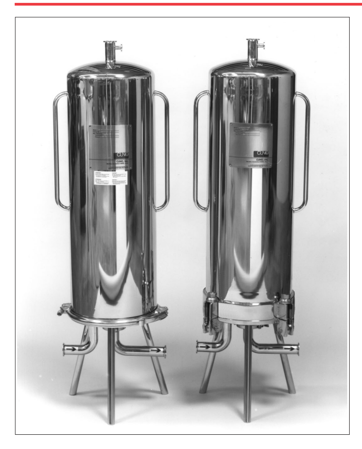
Zeta Plus Sanitary Housings: ZPC (left) & ZPB (right).

Zeta Plus Generation 2 sanitary housings provide the ultimate standard for totally-enclosed Zeta Plus filter cartridge systems. Constructed from 400 grit, mirror finish, 316L stainless steel, Zeta Plus ZPC & ZPB housings meet the exacting sanitary quality standards of the pharmaceutical, food and beverage, fine chemical, and microelectronics industries.